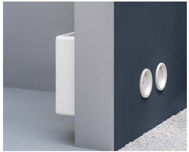
Exhibition mounting, the two holes should be made on the outside of the building.