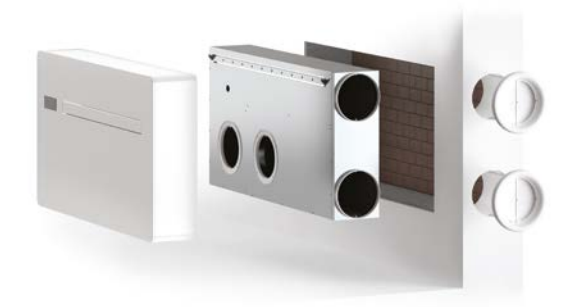
Soloclim with a side installation kit.